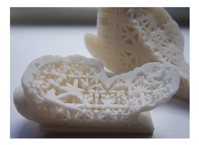
Figure 2: The Stanford bunny printed in ABS using an open cellular structure infill.

In [MRA14], the authors propose a solution to the problem of, given a volume boundary, to automatically define a parametrized shape that is suitable for additive manufacturing given any volume cell subdivision. In [MMRC15] a similar reasoning is used to propose the adaptive voids algorithm, an automatic approach to generate a parameterised adaptive primal and/or dual cellular structure infill. The output of this approach can potentially be applied in various applications, including design and engineering, architecture, clothing and protective equipment, furniture and biomedical applications. In [WLC10] a solid modelling framework is proposed that takes advantage of the architecture of parallel computing on modern graphics hardware. Solid models in this framework are represented by an extension of the ray representation - Layered Depth-Normal Images (LDNI), which inherits the good properties of Boolean simplicity, localization and domain decoupling.