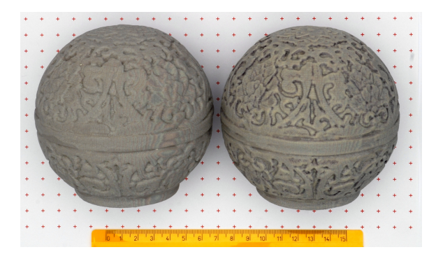
Figure 4: By controlling the diffuse colour during the fabrication process the subsurface scattering effect that reduces the perception of small scale geometry can be counterbalanced.

Related to the issue of controlling the appearance, we can also mention [CGPS08] where the authors face the problem related to the fact that 3D printed materials have a significant subsurface scattering behaviour that often reduces the perception of details and fine scale geometry. Hence, they propose to simulate and counter balance the impact of these effects by procedurally changing the diffuse base component of the object in order to better match the desired properties. [STTP14] propose an algorithm that solves for the shape of a transparent object such that the refracted light paints a desired caustic image on a receiver screen.